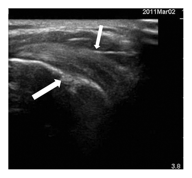
Figure 1. Ultrasound image of shoulder, 9.5 weeks after vaccination. Lower arrow indicates cortical irregularity on the superolateral humeral head. Upper arrow indicates partial tear of the supraspinatus tendon.

but no limitations in function. Ultrasound images at that time demonstrated residual fluid at the supraspinatus with a consistent cortical irregularity. In follow-up with the patient, at 16 months after the initial injection, she reports that her range of motion and strength continue to allow her to conduct all her desired daily activities.